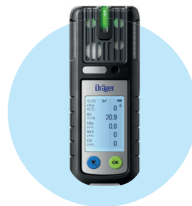
Dräger X-am® 5800 Multi Gas Detector