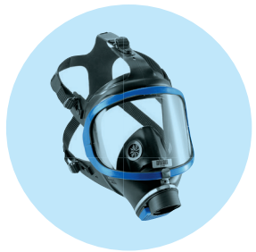
Dräger X-plore® 6300 & 6530 Full Face Mask with AX-Filter