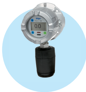
Dräger Polytron® 8100 EC Detector for toxic gases and oxygen