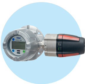
Dräger Polytron® 8700 IR Flammable Gas Detector