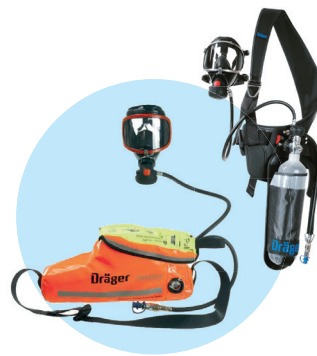
Saver CF/PP Emergency Escape Breathing Apparatus Dräger PAS® Colt Short-duration breathing apparatus