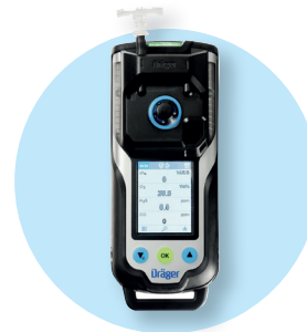
Dräger X-am® 8000 Multi Gas Detector