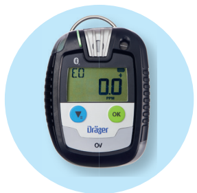
Dräger Pac® 8000 Single Gas Detector