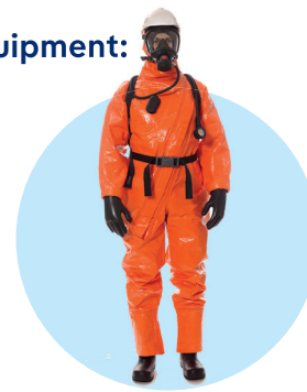
Dräger CPS 5800 Chemical Protection Suit